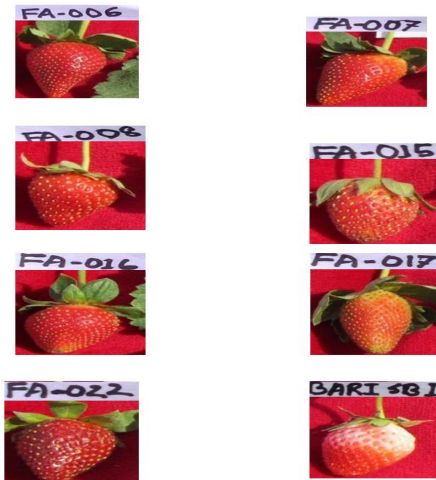
Fig-2. Fruit characteristics of eight strawberry genotypes