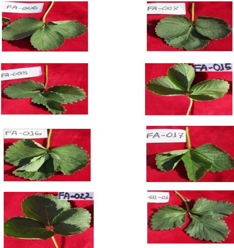
Fig-1. Leaf characteristics of eight strawberry genotypes