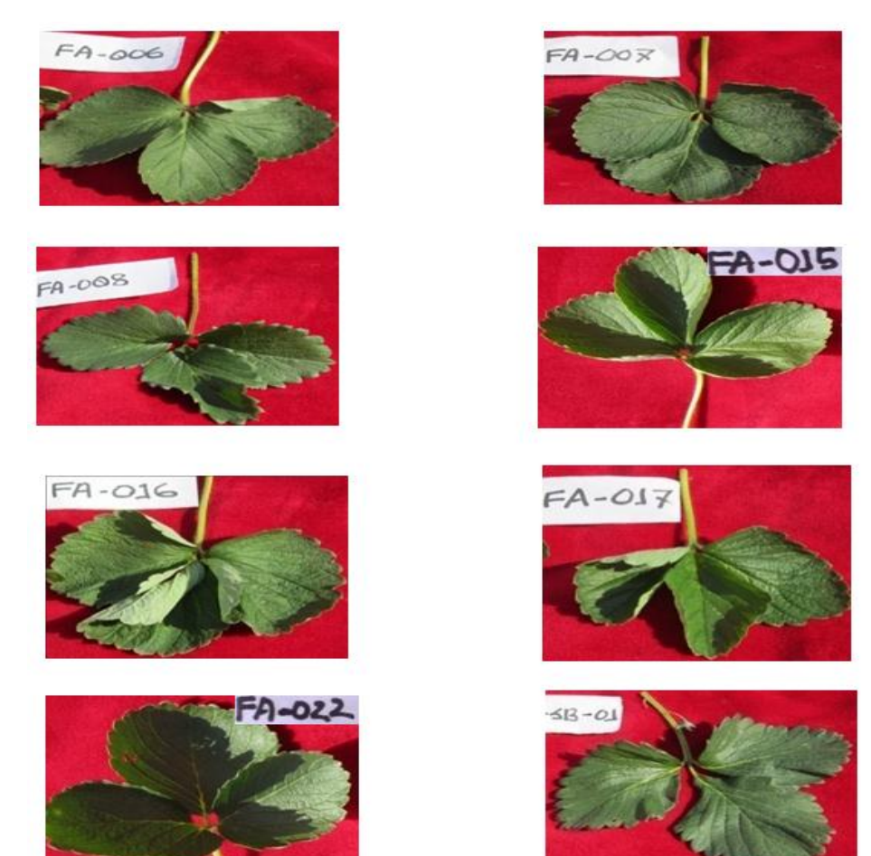
Fig-1. Leaf characteristics of eight strawberry genotypes