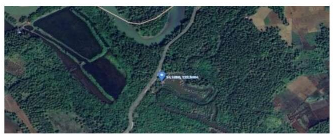
Figure 1. Location of the study.