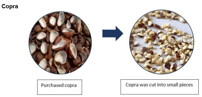
Figure 2. Preparation of Mud Crab Feeds.